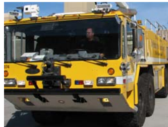
City of Phoenix (AZ) Sky Harbor International Airport

Fully integrated vision systems to aid and assist operators to quickly respond to the scene of airfield emergencies. Use the Thermal Imaging technology for Drivers Enhanced Vision and to detect a Brake Fire. The integrated 10.4" Display and Thermal Imaging camera meet all the requirements of FAA AC150.