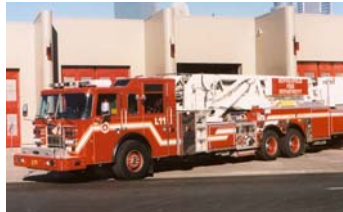
City of Minneapolis (MN) Mid-Mount Aerial Platform

Keep Firefighters out of harms way and make efficient use of time and resources. Helping Firefighters determine the seat of a fire, where to properly and safely ventilate, and see lingering hot spots and embers minimizes unnecessary teardown. Detect lost and missing persons on Urban Search and Rescue (USAR) missions.