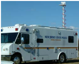
New Jersey State Police Mobile Command