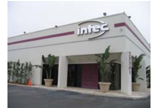
INTEC Headquarters Laguna Hills, California

INTEC pioneered the use of dual camera technologies for commercial applications introducing the 1 st generation Video Sentinel in 1995. The present design described here is the culmination of 10 years of experience in both the technology and application. We pride ourselves on our many "industry first" innovations and our experience that has spanned almost 40 years since our founding in 1970. Our in-depth knowledge combined with the best customer service and support in the industry provides a superior value for our customers.