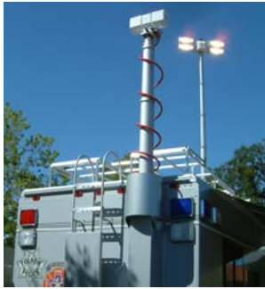
City of Folsom (CA) Police Mobile Command